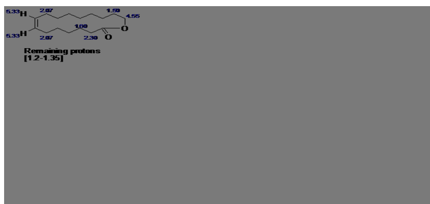
Figure-3: 1 H NMR Proton Assignments.